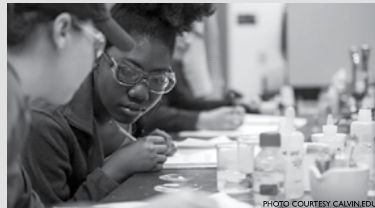
A student’s reaction upon finding that financial aid would be discontinued.