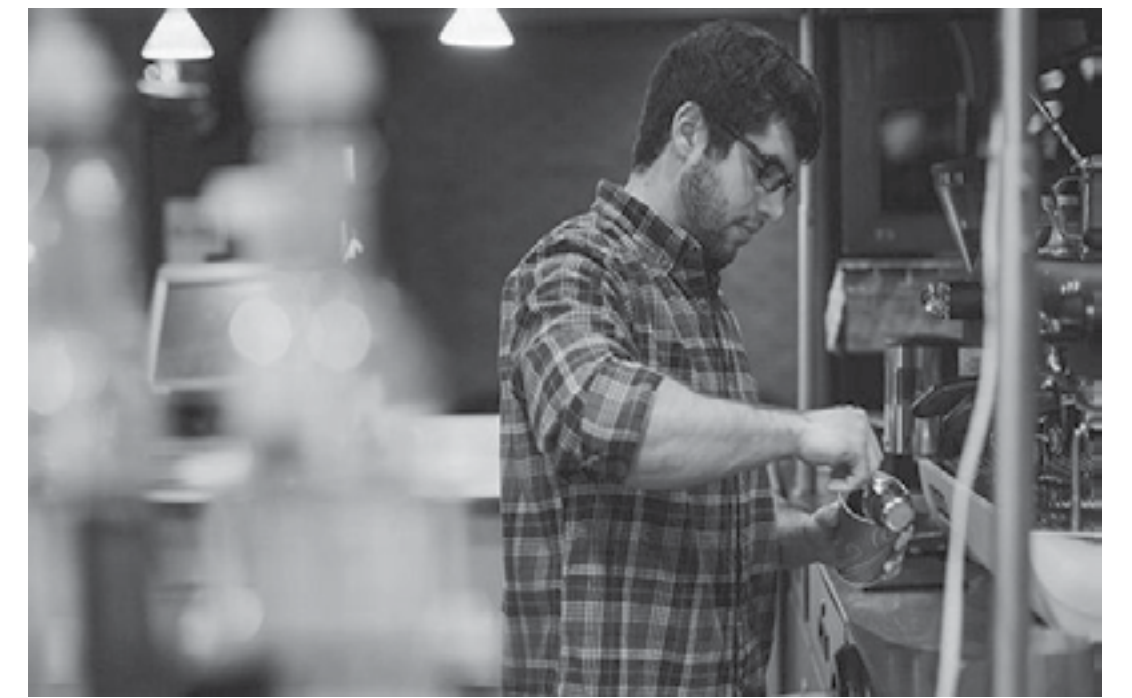
Phish House barista brews a hackuccino.

“We’re even considering having a Phishing Email Night, where students can make their own phishing emails.”