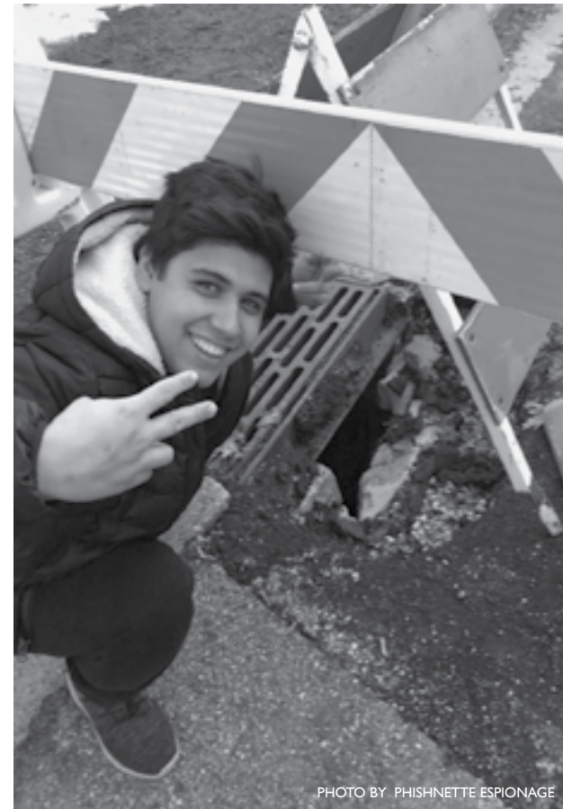
Pictured above: secret passage leading to hidden campus with Daygo Galvanizer posing.

Stay tuned as The Kazoo investigates this developing story.